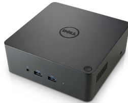
Dell Thunderbolt™ Dock | TB16