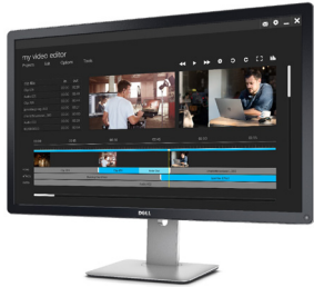
Dell UltraSharp Ultra HD 4K Monitor with PremierColor | UP3216Q