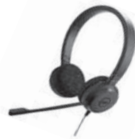
Dell Pro Stereo Wireless Headset – UC650