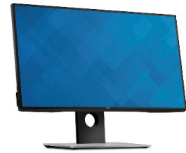
Dell UltraSharp 24 InfinityEdge Monitor – U2417H