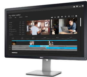
Dell UltraSharp Ultra HD 4K Monitor with PremierColor | UP3216Q